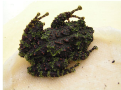
A mossy frog owned by Ange